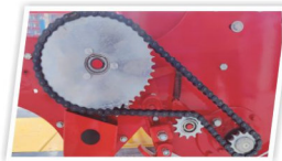
Heavy Duty Chain Drive System High Quality Boron Steel Blades