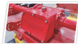
Heavy Duty Gear