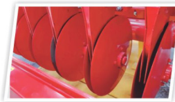
SS Steel Disc