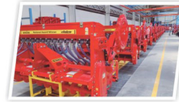
Advance Assembly Line